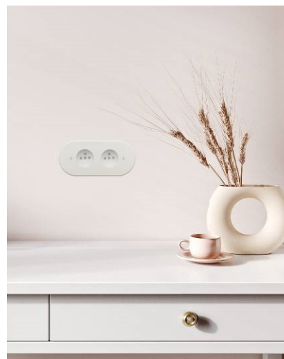
Bespoke model, brass with epoxy

With pure lines and attractive shades, they are the perfect finishing touch for relaxing interiors where clarity and softness provide a much-needed oasis of serenity in a visually cluttered world.