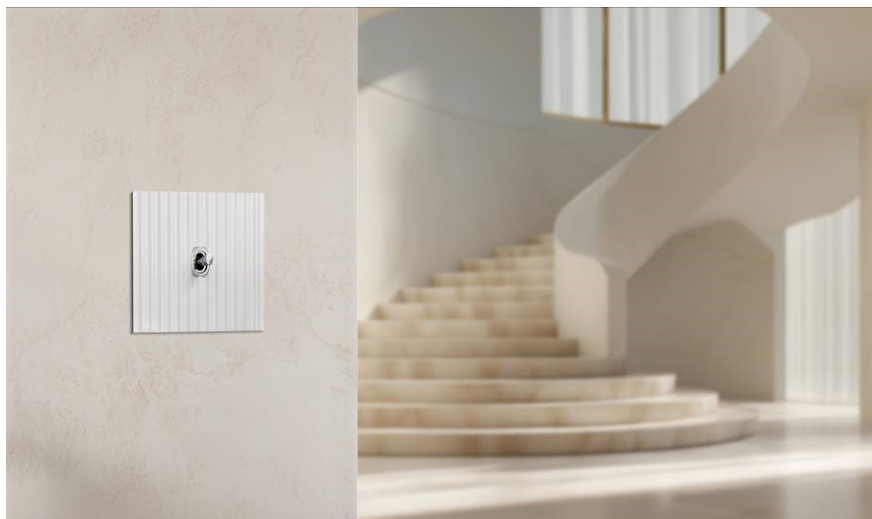
Cannelée collection, brass with epoxy

These combinations create spaces characterised by serenity and balance, while also showcasing Meljac's expert craftsmanship in surface treatment.