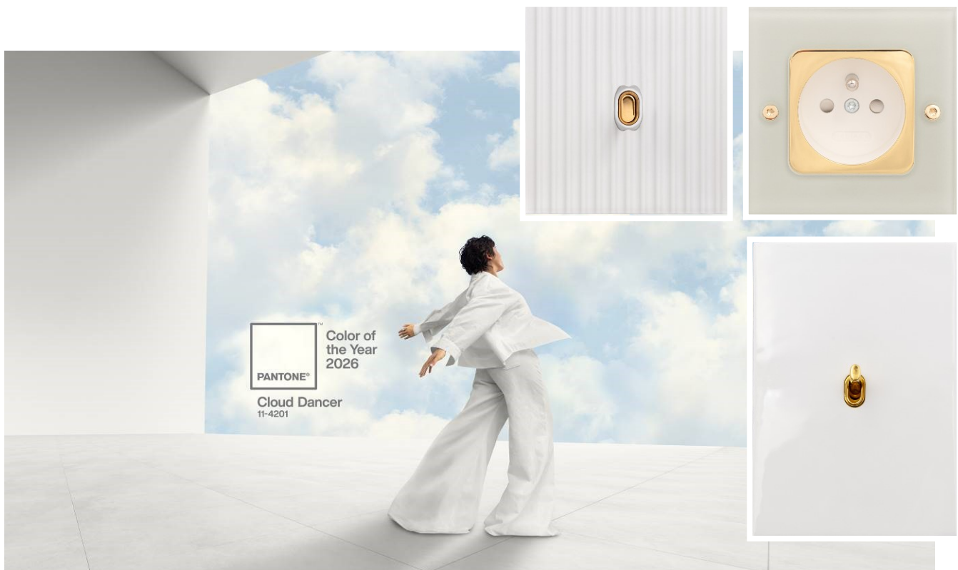
Cannelée collection, painted brass – Pierrot collection, tempered glass – Limoges collection, enamelled porcelain.