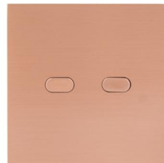
Brass with a Satin Copper finish

Meljac's French-produced creations reflect a winning combination of state-of-the-art technologies and the irreplaceable human touch. Made of solid brass, they are uniquely attractive and long lasting, qualities on which the brand has built its reputation.