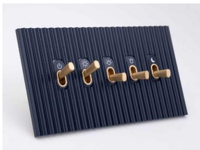
Meljac Cannelée collection for the Cheval Blanc St Tropez luxury hotel (Lutron)

The Meljac switch is directly connected to the distribution panel by the installer, or snap fitted to a module in the back box.