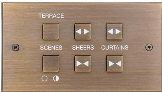
Pre-wired switch in the Meljac Damier collection