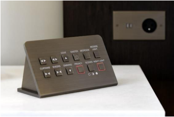
MELJAC console for the Mandarin Oriental Paris (Incom Honeywell system)