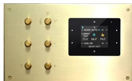
Meljac casing for a Crestron keypad