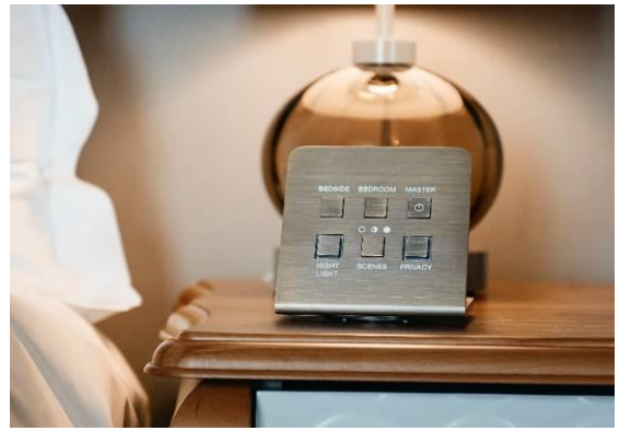
MELJAC console for the Mandarin Oriental Munich (KNX system)