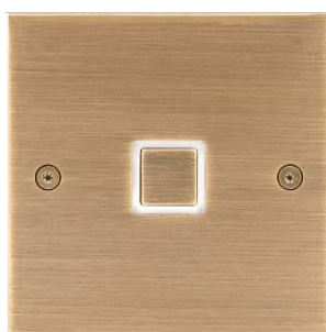
Backlit button, brass, Light Bronze finish