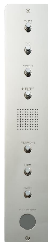
Lift plate, brass, Polished Chrome finish