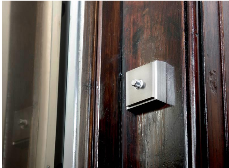
Brass doorbell, Brushed Nickel finish

Découvrez les secrets du savoir-faire MELJAC en vidéo :