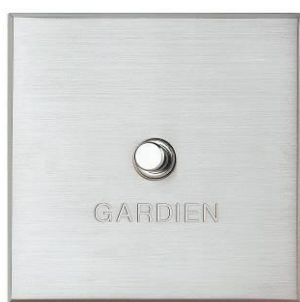
Brass, Brushed Nickel finish