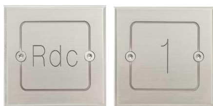
Floor plates, brass, Brushed Nickel finish