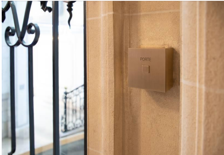
Door button, brass, Light Bronze finish