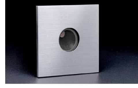
Distribution: <a href="https://www.meljac.com/contact/">https://www.meljac.com/contact/</a>