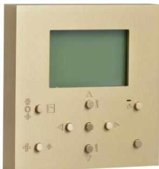
Brass, with a Brushed Brass finish (Daikin model)

MELJAC, the leader in luxury electrical fittings, creates bespoke brass casings for air conditioning control panels.