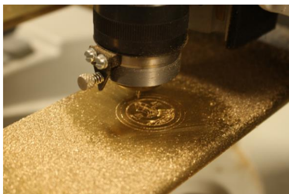
Engraving of the Lutetia logo after machining of the brass