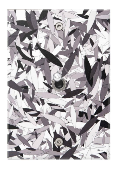
Brass, 1 Classique toggle