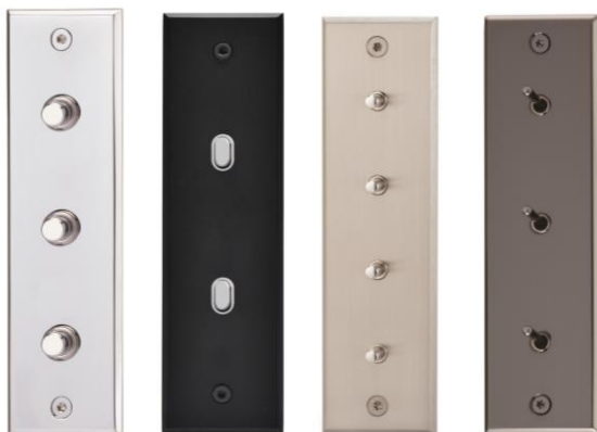
Nickel Brillant Finish 38x133x3 mm

Narrow switches are available in the Classic collection (chamfered edges) and Ellipse and Damier collections (straight edges). There is a choice of mechanisms such as levers, push-buttons, 12V mini buttons with or without covers and clients may even combine several designs should they wish.