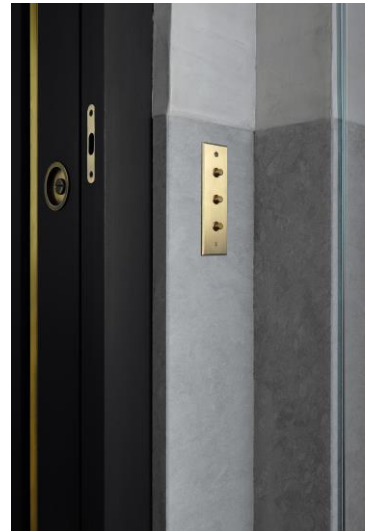
Bronze Medaille Clair Finish (38x133x3 mm)

The recognised expertise of MELJAC makes the brand the indisputable benchmark in the field of attractive, French-made, quality electrical fittings.